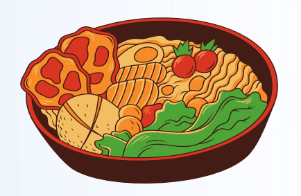
£3 Dinners at the Courtyard

The University and SU brought forward cost-saving changes to City students including